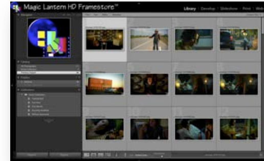
Screen shot of indexing / review window