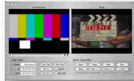
Screen shot of capture window

Basic capture and review system (non-compositing): 225.00 /day Add compositing option +25.00/day